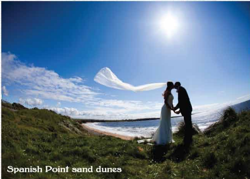
Spanish Point sand dunes