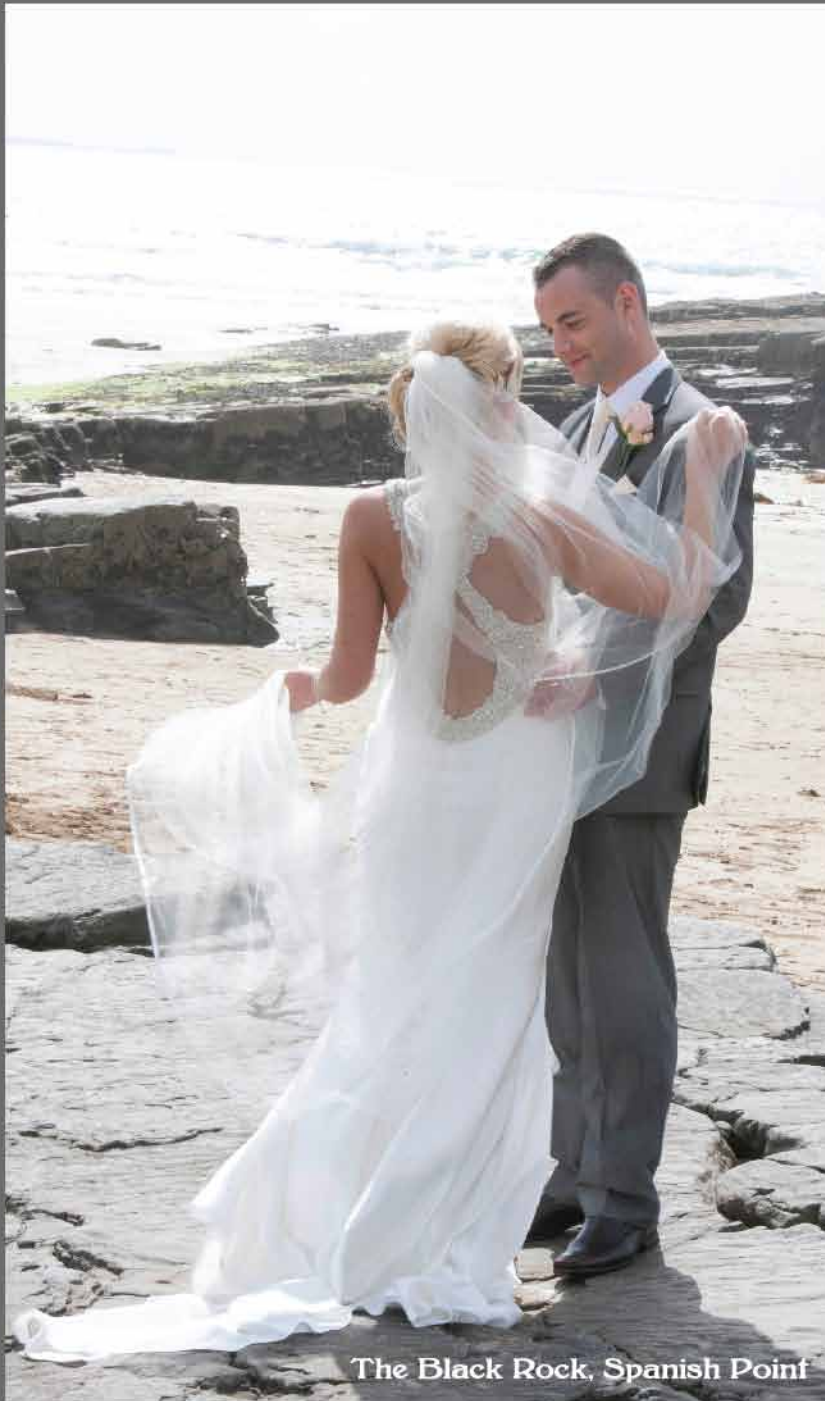
The Black Rock, Spanish Point