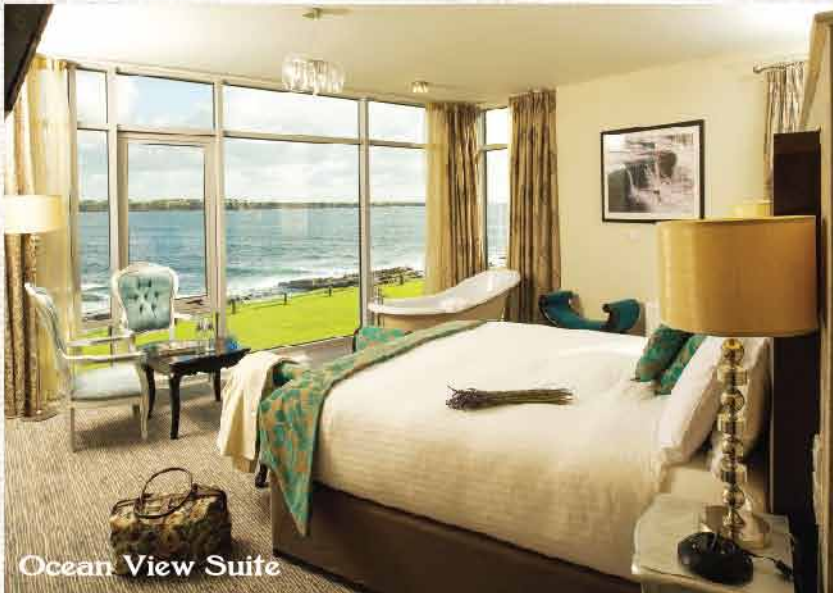
Ocean View Suite