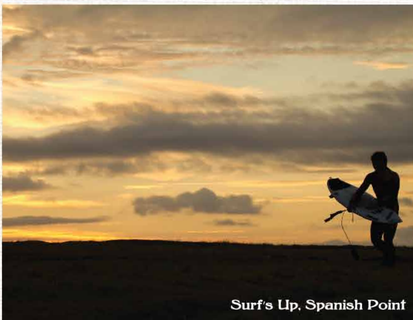
Surf's Up, Spanish Point