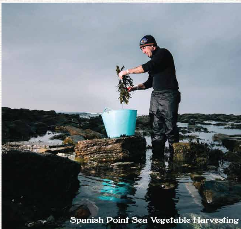
Spanish Point Sea Vegetable Harvesting