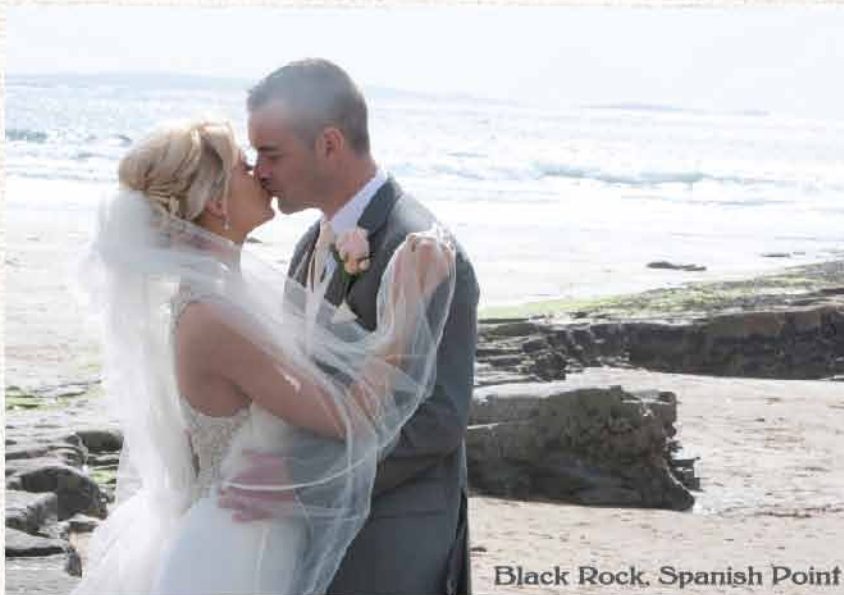
Black Rock, Spanish Point