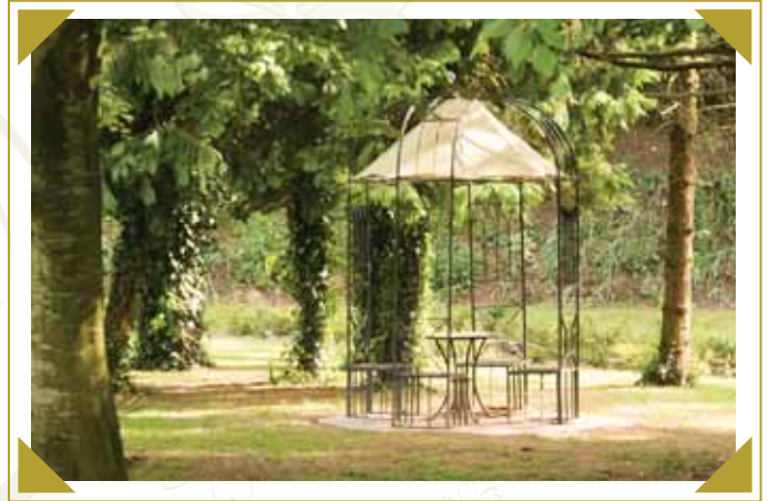
The Wooded Gardens

The Station House Hotel stands on acres of beautifully landscaped gardens and lawns. This ensures a wealth of photographic scenic backdrops for your wedding album.