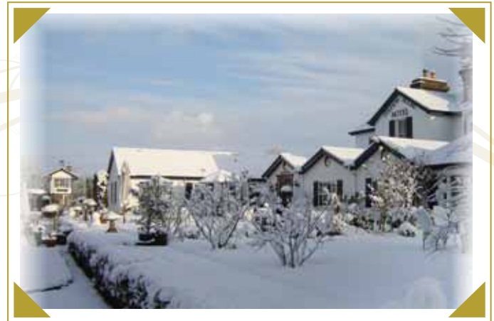
Winter weddings are truly magical