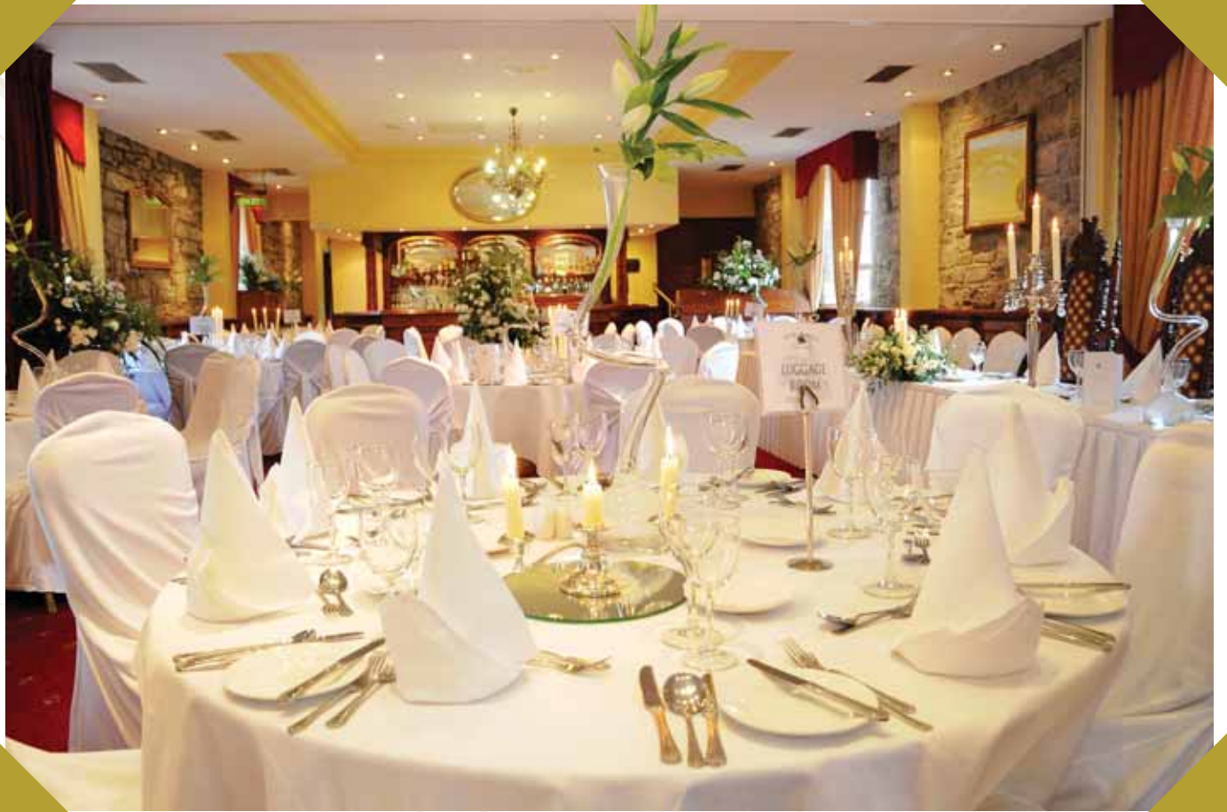
Luxurious Carriage Suite