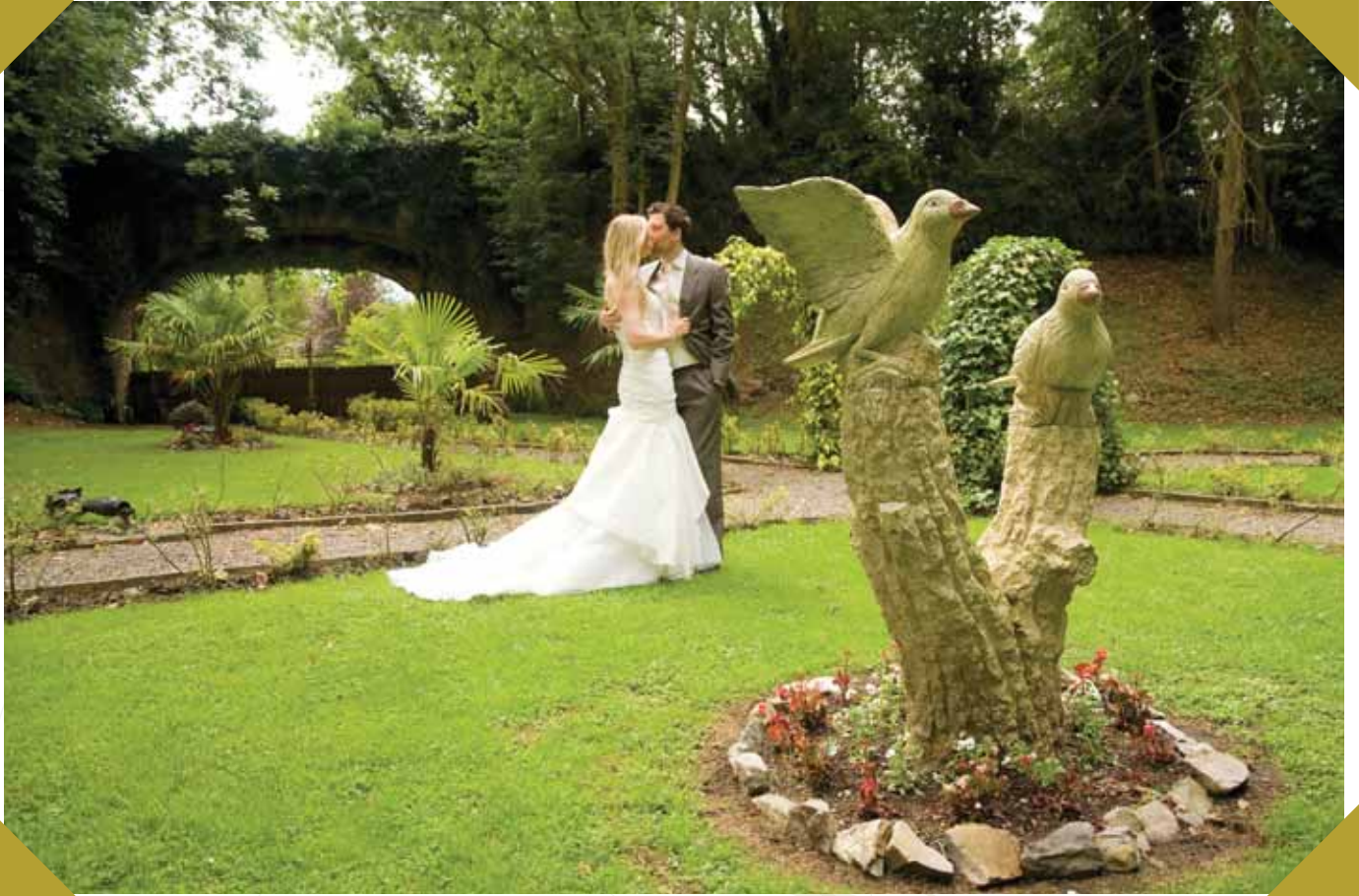
The Bridge Gardens