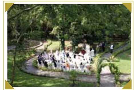
Indoor and outdoor ceremonies