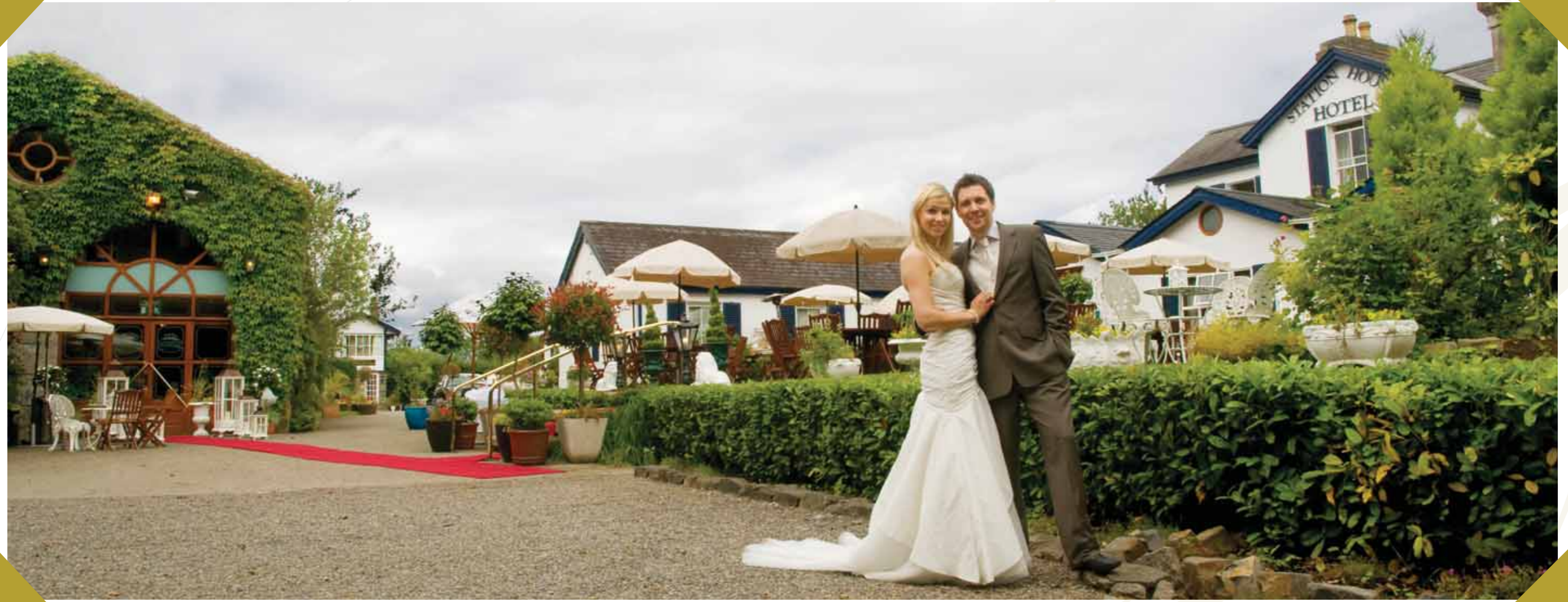
The Carriage Suite, Signal House & Hotel Entrance

From the moment you and your guests arrive, the experience will be of warmth and welcome.