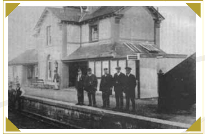
Ticket Office, Luggage Room, Diner, Masters Residence